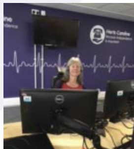
Our Control Centre, based in Letchworth Garden City, Hertfordshire