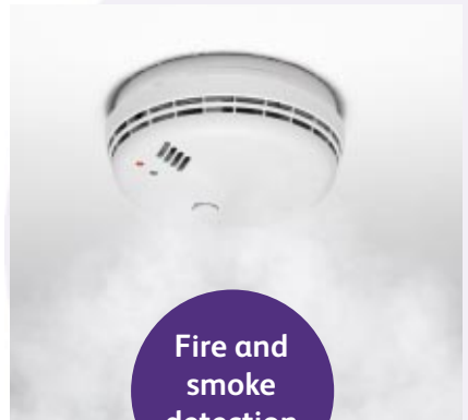
Fire and smoke detection

Need to be aware of: If the service user or patient or live-in carer is hard of hearing then we can provide a range of amplification, visual, or physical alert equipment so that can react quickly in the event of a fire.